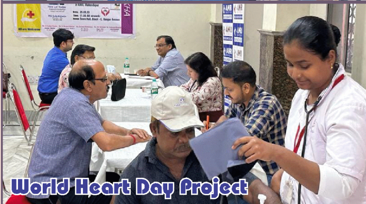
World Heart Day Project