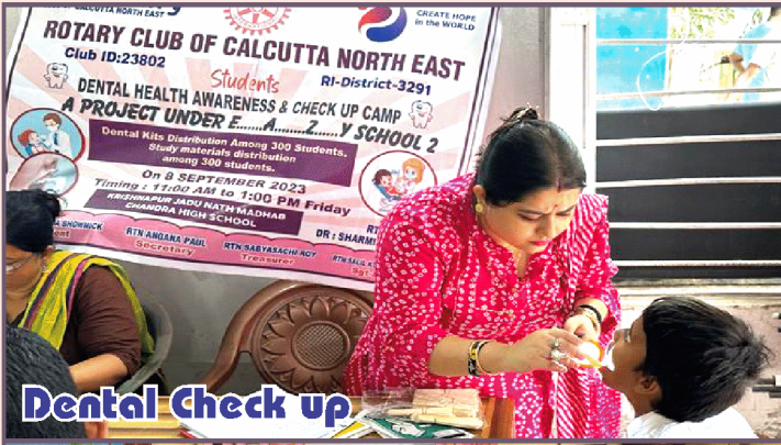
Dental Check up