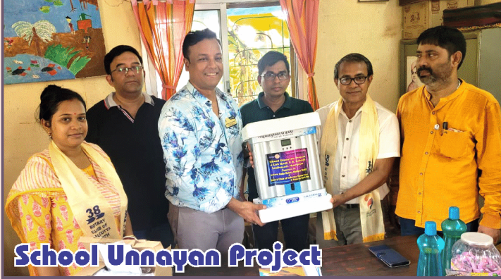
School Unnayan Project