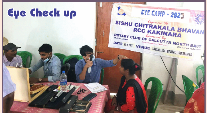
Eye Check up